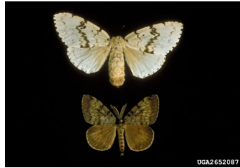
Adult Female (top) and Male (bottom)