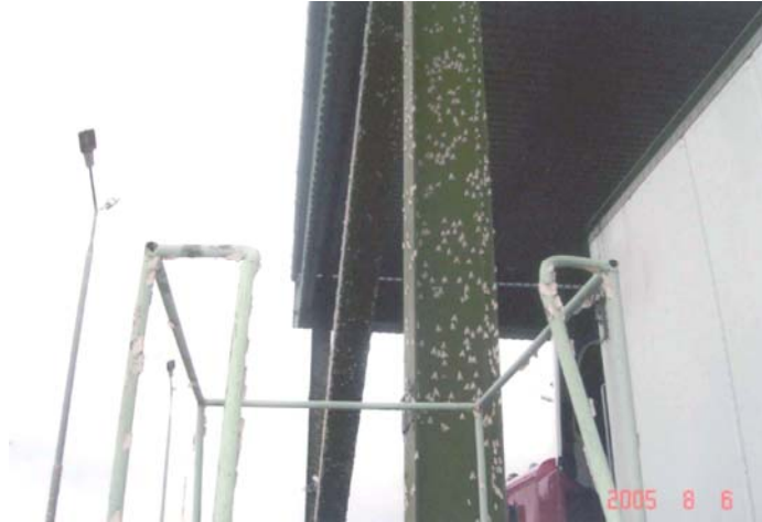
A vessel covered with egg-laying Gypsy Moths in a Russian Port

Knife, paint scraper, or putty knife - to scrape the eggs from the structure.