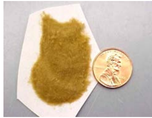
Gypsy Moth egg mass next to penny